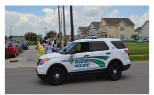
HANO PD patrols The Estates community