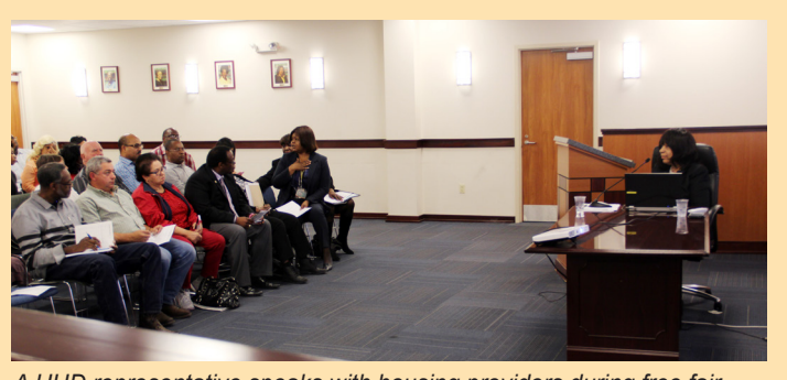
A HUD representative speaks with housing providers during free fair housing training in the Helen W. Lang Memorial Board Room

In May, HANO and HUD hosted its second meeting with