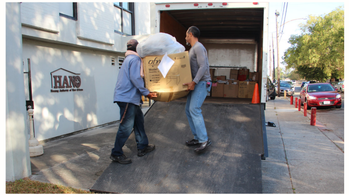
HANO staff members donate a number of items to Baton Rouge flood victims

HANO employees donated non-perishable can goods, bottled water, clothing, toiletries, cleaning supplies and much more. Donations were distributed to Star Hill Baptist Church, Greater King David Baptist Church, and Destined for Success Worldwide in Baton Rouge.