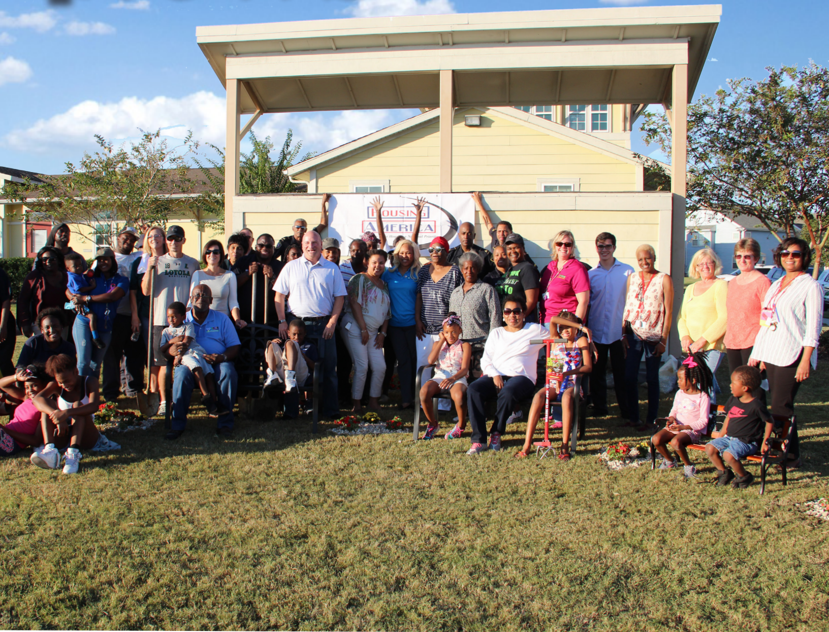
NAHRO Community Service Project at The Estates Community