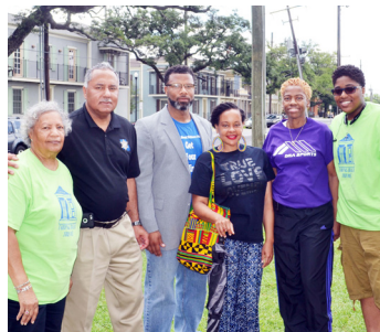
Faubourg Lafitte's Lafitte Retreat