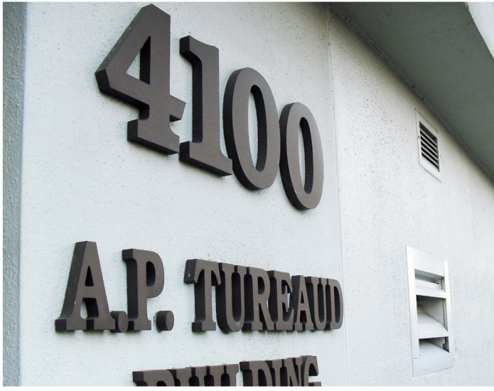
Housing Authority of New Orleans

The agency has implemented significant changes to the Section 8 Housing Choice Voucher Program (HCVP). Following an extensive, five month review of the full operations of the program, a strategy was developed to improve the agency's customer service performance and delivery. The new structure has been in place since February 1, 2017, and departmental changes have been posted on the agency's website at www.hano.org . For more information regarding changes to the HCVP Department, or to inquire about the status of an application, call 504-670-3300. Participants currently on the wait list can also e-mail info@hano.org to update application information.