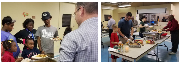
Faubourg Lafitte residents enjoy a traditional turkey dinner thanks to Whole Foods Market and Liberty’s Kitchen

For more information on community events at the Sojourner Truth Neighborhood Center, visit their Facebook page at https://www.facebook.com/SojournerTruthNOLA/ .