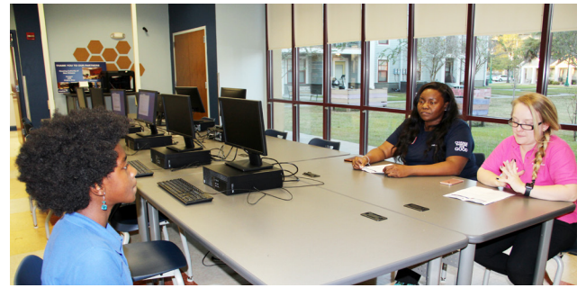
READesign Technology Lab at the Fischer Community Center

R esidents of the Fischer Community recently celebrated the unveiling of two brand new computer labs donated by Capital One Bank.