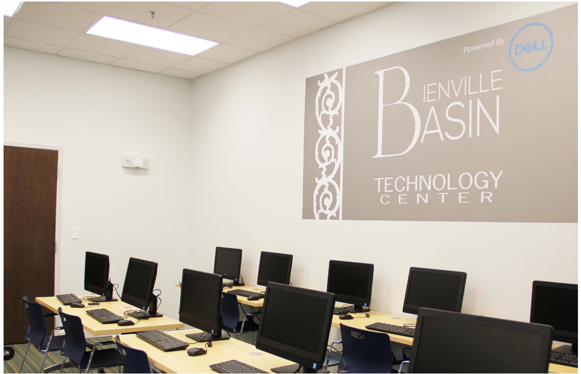
Bienville Basin Technology Lab Presented by Dell