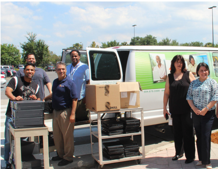
HANO's Information Technology Department accepts a generous computer donation from representatives of Whitney Bank

For more information on HUD's ConnectHome initiative, visit www.HUD.gov .