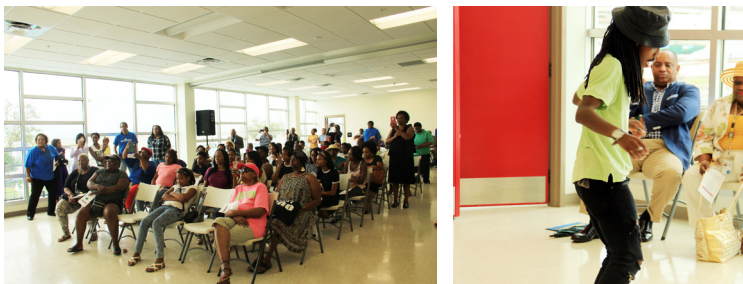
Marrero Commons' Parent Awareness Program at the Rosenwald Recreation Center