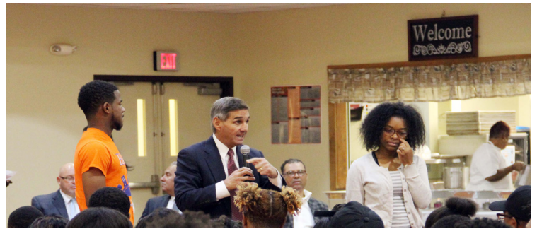
HANO's Youth Program connects over 100 students with state and city leaders in the criminal justice system

H ANO, in conjunction with city officials, community leaders, and residents, hosted a Proactive Youth Program this summer for over 100 students participating in HANO's Summer Employment Program. The youth program, held at the Franklin Avenue Baptist Church, presented high school and college students with the opportunity to connect with a number of local criminal justice agency administrators and public officials.