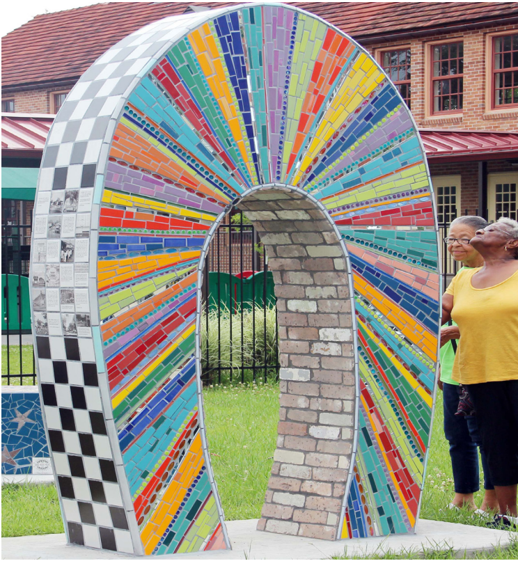
Faubourg Lafitte's Magic Archway

T he Housing Authority, in partnership with developers Enterprise Community Housing and Providence Community Housing, recently celebrated the unveiling and dedication of a public artwork, Magic Archway, in the Faubourg Lafitte community. The Magic Archway, located on Magic Street between N. Galvez and N. Johnson Streets, consists of two mosaic benches and a horse-shoe shaped mosaic arch.