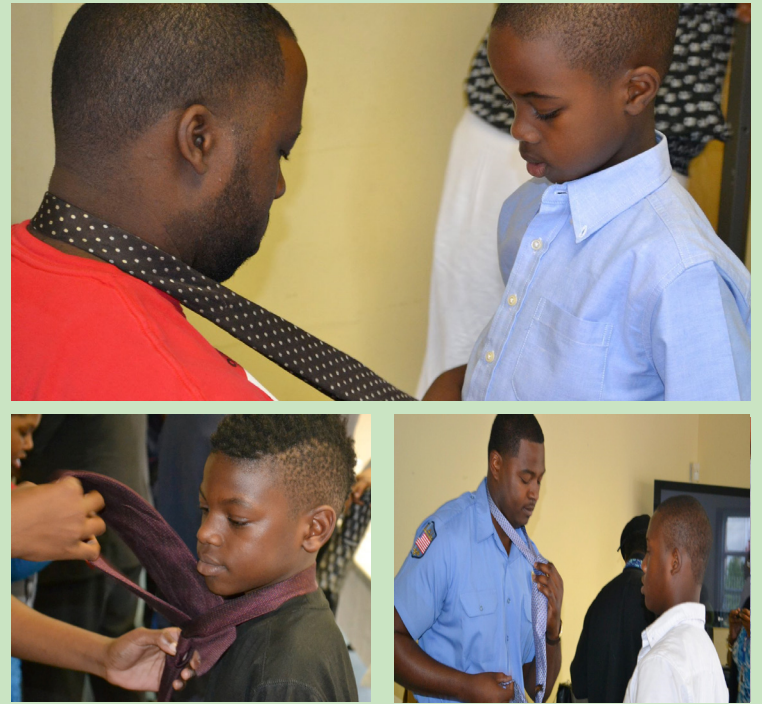
Young men from the Lafitte community learn the basics of tieing a necktie during the Save Our Sons event

To learn more about the Save Our Sons initiative, contact the Sojourner Truth Neighborhood Center at (504) 827-9963.