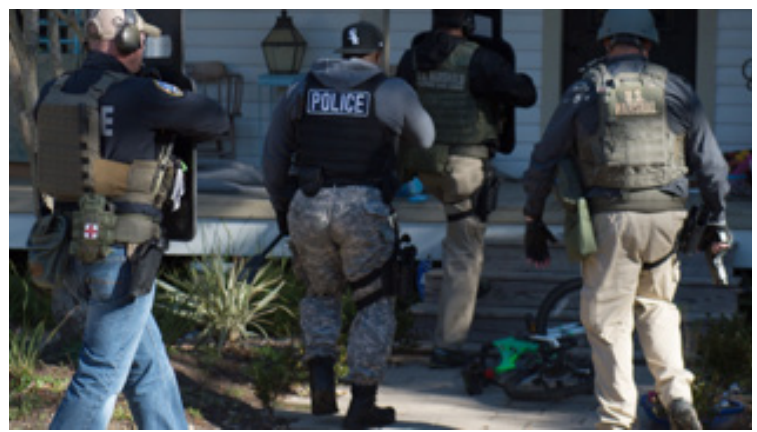
OVR12 Operation Team enter a home in pursuit of a wanted criminal