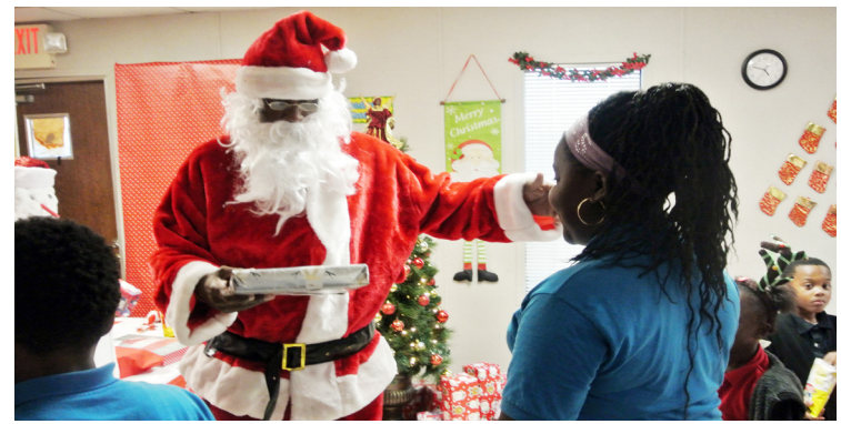
Santa distributed Christmas gifts to each of the participating children during the Christmas program

For more information on how to adopt a family for the next holiday season, contact HANO's Department of Client Services at (504) 670-3300.