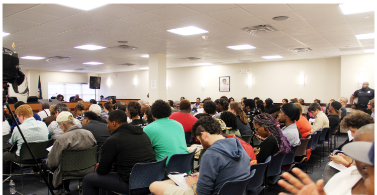
March 2016 Board Meeting well attended by public housing advocates, local media and concerned citizens

For those not barred by federal law, criminal convictions will be assessed to determine the safety risk and wellbeing of the community. Applicants whose convictions do not suggest a significant level of risk will be deemed admissible for housing assistance. Those that suggest a significant level of risk will be reviewed by a panel of HANO officials or its agents to determine whether the applicant should be admitted to housing or denied. Risk assessment criteria used during the review process is detailed in the Criminal Background Screening Procedures and can be viewed at <u>www.HANO.org</u>.