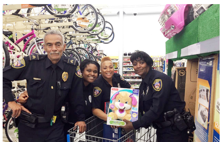
HANO PD Officers shop for holiday gifts for two needy families in The Estates community