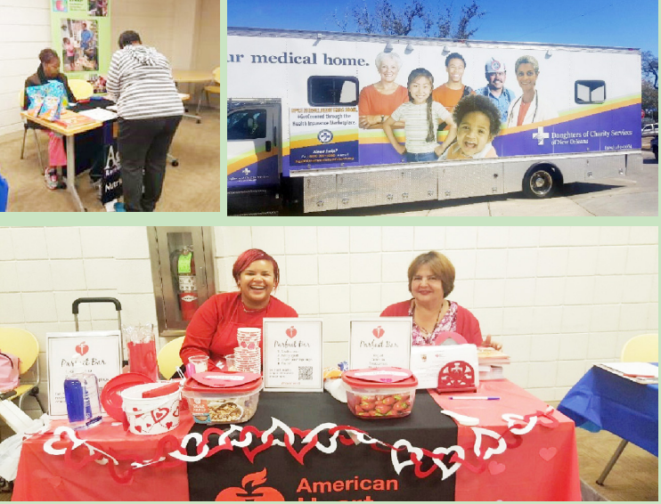
Harmony Oaks' Annual Health and Resource Fair

More than 20 local organizations and vendors participated in the fair, including American Heart Association, Daughters of Charity, Odyssey House, WellCare, Planned Parenthood, YAYA, Inc., Cox Communications, LSU AgCenter, Luke's House Clinic, Kingsley House, and many more. Representatives from American Heart Association led a food demonstration and provided tasty parfait desserts for the attendees. In a private room, Odyssey House's OHmega program offered free HIV and Hepatitis C testing during the fair. Daughters of Charity's mobile van was also stationed outside of the community center, providing free blood pressure and glucose checks.