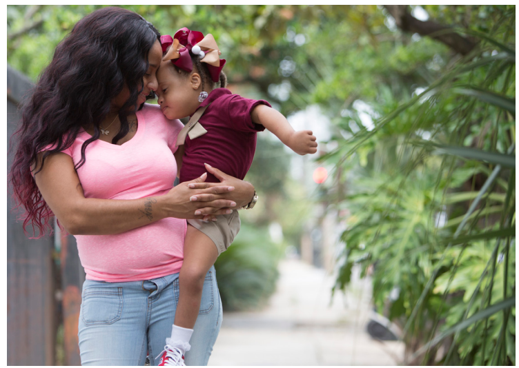
Participants of Kingsley House's Parents as Educators program