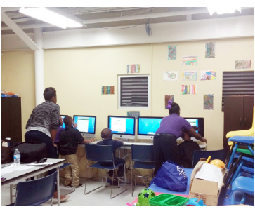
Tutors at Lafitte's After School Program provided homework assistance to its students