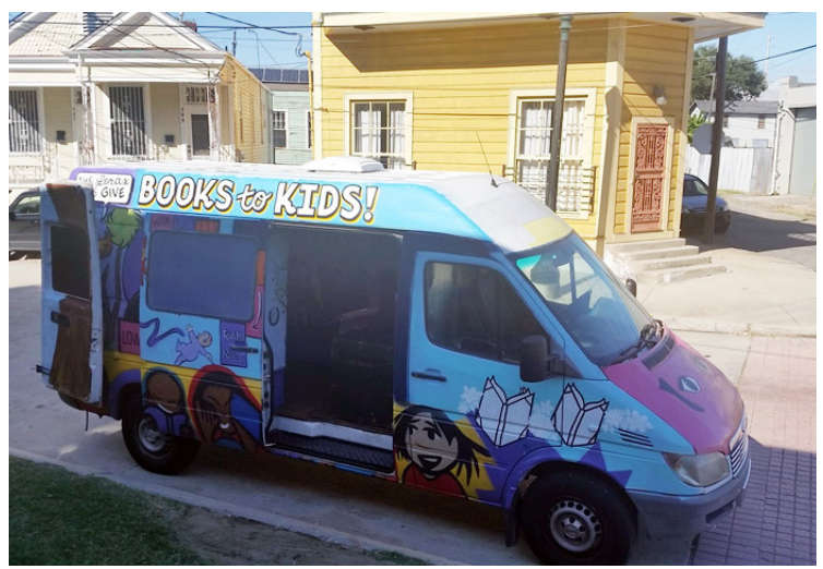
River Garden's After School Program hosted the Books to Kids Mobile Reading Van for participating students

For more information about HANO's after school enrichment program, contact the Department of Client Services at (504) 670-3300.