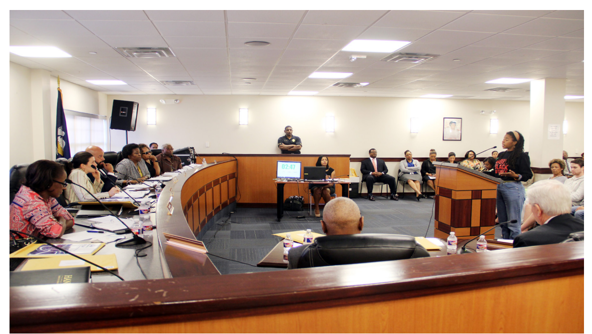
HANO's Board of Commissioners listens to comments of a public housing advocate

n March, the HANO Board of Commissioners officially adopted the agency's Criminal Background Policy and Procedures following a series of stakeholder sessions and public meetings. HANO convened a group of housing and ex-offender advocates, resident leaders, landlords and third party property managers to conduct a thorough review of the policy originally written and adopted by the former administration.