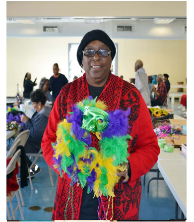
A Lafitte senior program participant proudly displays her decorating skills during a wreath decorating class

The Senior Program hosts over 80 seniors who participate in community supportive programs focused on health, nutrition, exercise, mental health, social outings and arts and crafts. Throughout the year, the Senior Program keeps seniors active with a computer training class