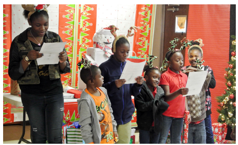
Young residents from The Estates donned elf ears while performing a Christmas carol