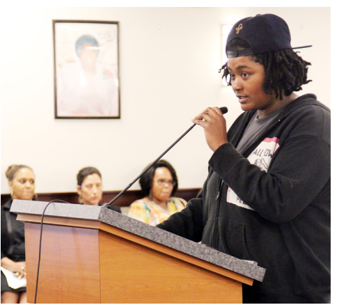
A member of Stand With Dignity comments during the March 2016 Board Meeting

lifetime registered sex offender, has been convicted of manufacturing or producing methamphetamine at a federally assisted facility, or has been evicted from housing due to criminal activity during the previous three years with the exception of those with eviction