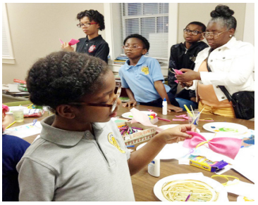
Students at River Garden's After School program enjoyed arts and crafts activities