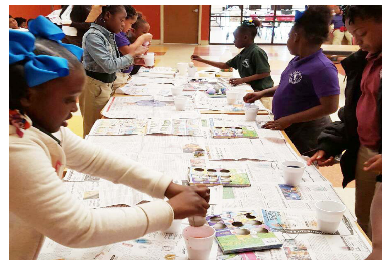
Fischer's After School Program participants decorated eggs in celebration of the Easter holiday at the Fischer Senior Village Community Center