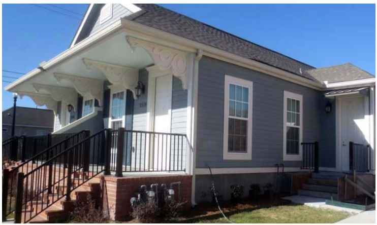
The New Florida Housing Community

Applications will be lotterized at the end of July to determine applicant positions. HANO staff will contact applicants for a program eligibility review when the application is reached. Beginning in July, visit HANO's website at <u>www.HANO.org</u> to check your application status. Applicants must update any changes in contact information via e-mail at <u>info@hano.org</u>.