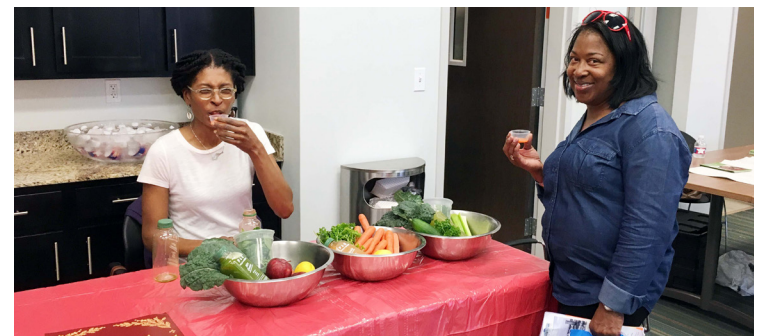
A fair participant samples a healthy beverage with Pulp and Grind

Heart Association, and Diva Dawg Food Truck. Other participating organizations included HANO's Homeownership Program, Ekhaya Youth Project, Harper's Family Counseling, Catholic Charities, Odyssey House, Goodwill Industries, Planned Parenthood, and Kingsley House.