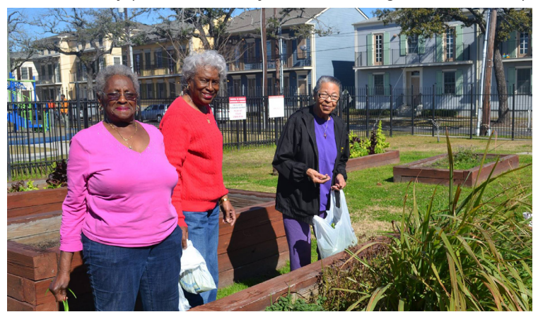
Participating seniors enjoy planting seeds in the community garden