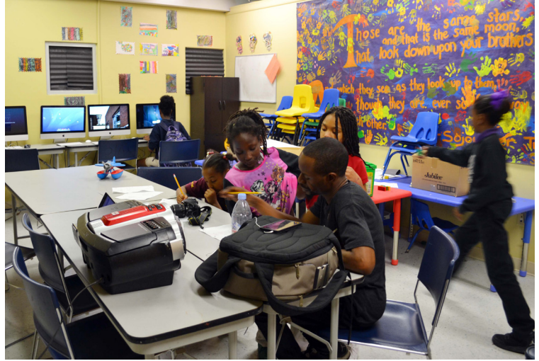
A tutor provided homework assistance to participating students in Lafitte's After School Program