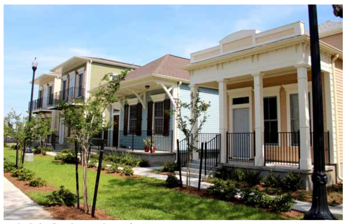
Tree lined sidewalks at the new Faubourg Lafitte

the construction of a Head Start Center that will reuse two of the historic Lafitte buildings.