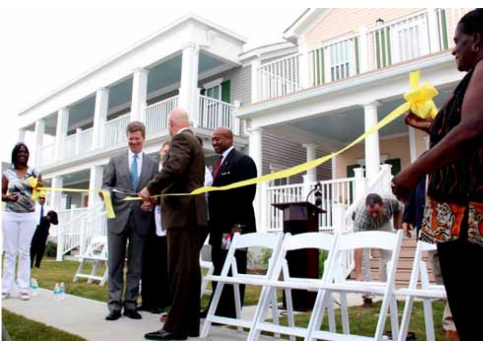
HUD Secretary Donovan and Mayor Landrieu cut the ribbon held by Cooper residents

of the redevelopment project. Another 126 homes are nearly completed. At the time of the event, approximately 20 families had already moved into the new one- to four-bedroom homes - including 13 former B.W. Cooper residents. By July 2013, there will be 410 homes that will serve nearly 300 low- to moderate-income households and 116 market-rate rental households. This includes 42 accessible homes for mobility impaired residents and nine additional accessible homes for hearing/visual impaired residents. The estimated investment for the project was nearly $160 million, which came from multiple sources, including HUD, the State of Louisiana, the City of New Orleans, HANO and the Federal Emergency Management Agency (FEMA).