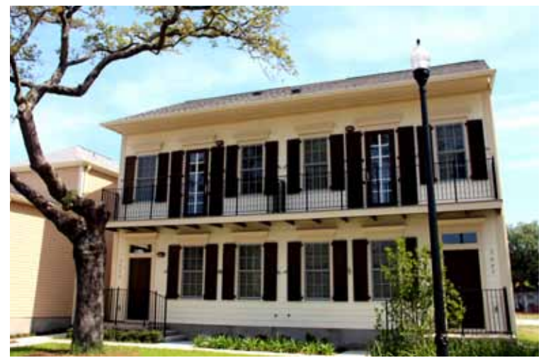
Multi-family apartments at Lafitte

This phase includes a pilot rainwater catchment system, and