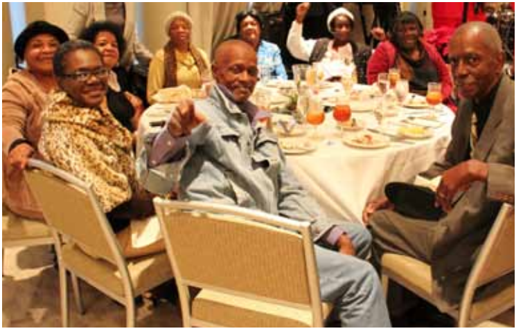
Elderly residents enjoy the 2011 Senior Holiday Banquet