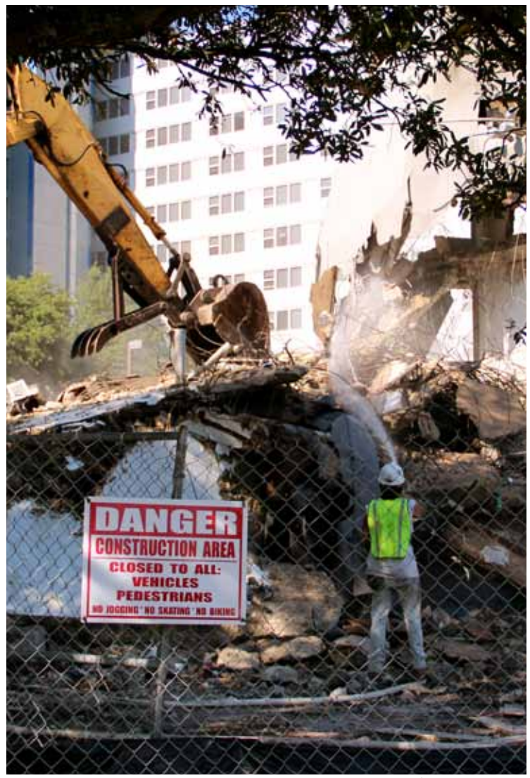
Demolition at Guste III

The old Guste II site was demolished along with Guste I in July 2004 as part of the HOPE VI demolition grant. The redevelopment of Guste II began in July 2010 and was completed in April 2012. The demolition of Guste III began in May to prepare the site's final phase of construction.