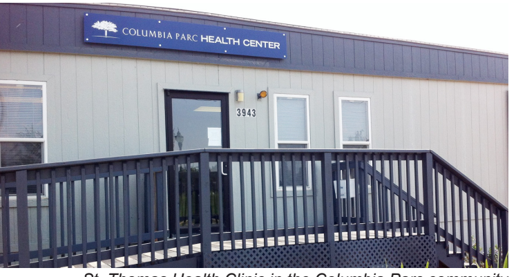
St. Thomas Health Clinic in the Columbia Parc community

Columbia management looks forward to continued success and the development of additional amenities for the residents of the community, and the surrounding neighborhoods in the years to come.