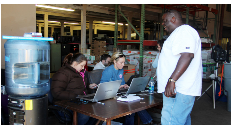
A potential bidder registers for HANO's live auction

The Housing Authority hosted its first public auction in several years to raise funds for the agency by selling 135 lots containing multiple items to approximately 50 registered attendees. The United Country Brown's Auction & Realty Co., LLC conducted the live auction on March 28th at HANO's warehouse located on Townsend Place in Eastern New Orleans. Vehicles, industrial mowing equipment, tools, building materials, computers and other electronics, office furniture, household items and much more were sold to the highest bidders, raising approximately $26,000 for the agency.