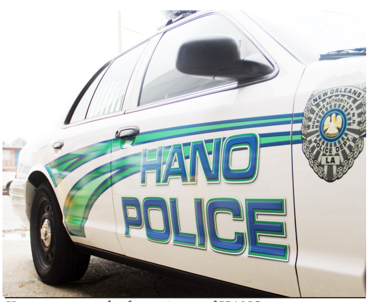
Keep an eye out for future issues of HANO news , the Crime Prevention Corner is a permanent feature educating readers on important safety tips.