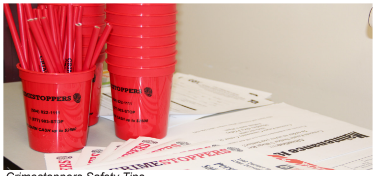
Crimestoppers Safety Tips

The Housing Authority's focus on crime prevention continued last October with the 2014 National Night Out Against Crime. Throughout the city of New Orleans, HANO communities and neighbors joined HANO PD and the New Orleans Police Department (NOPD) to strengthen police-community partnerships and promote crime prevention. The Guste community began the evening with a "Walk for the Cure" in honor of Breast Cancer Awareness Month. Residents of Harmony Oaks also observed Breast Cancer Awareness Month by donning pink for the night. In Gentilly, Columbia Parc encouraged its residents to meet their neighbors during their Night Out event. Other participating HANO communities included River Garden, The Estates, Fischer, Faubourg Lafitte, and Marrero Commons.