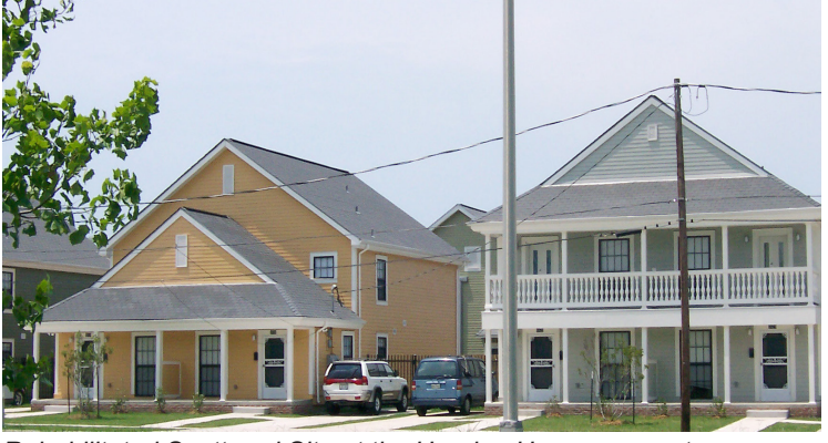
Rehabilitated Scattered Site at the Hendee Homes property