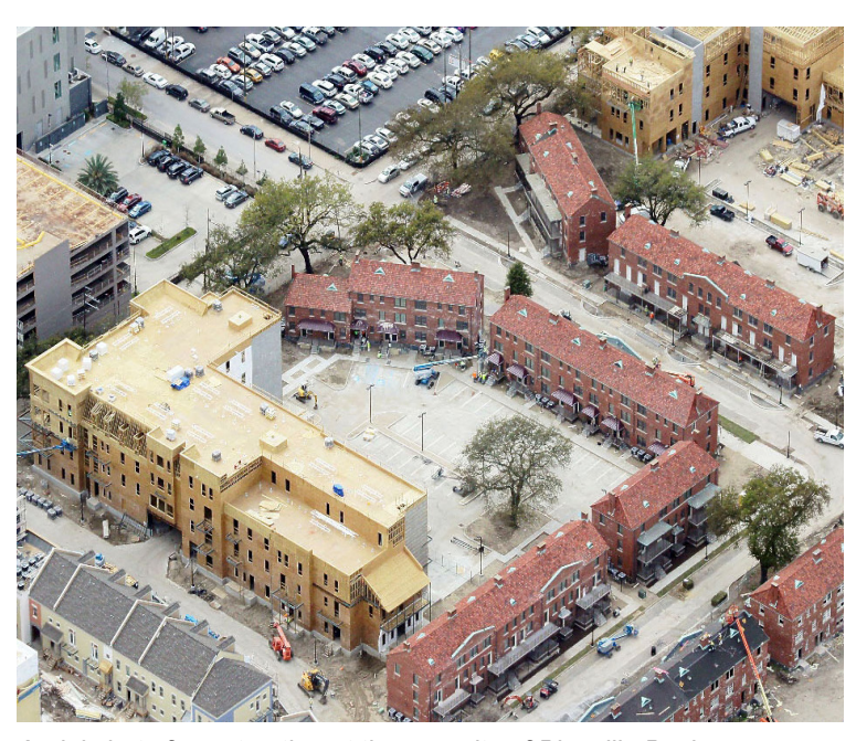
Aerial shot of construction at the new site of Bienville Basin

In January, developers kicked off the construction of phase III to include 105 additional units on site. HANO also executed an option to purchase a portion of the property formally known as the Winn Dixie site located east of Iberville. Developers will construct approximately 200 housing units, of which 65 will count toward the 800 committed replacement units as a part of the off-site component.