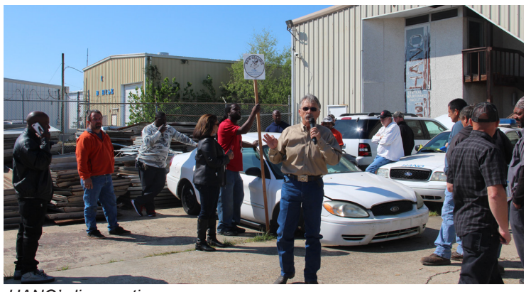
HANO's live auction begins at the agency's warehouse location