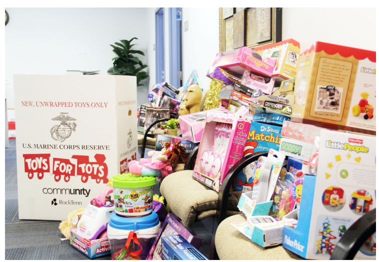
HANO employees donate toys to the 2014 Toys for Tots Drive