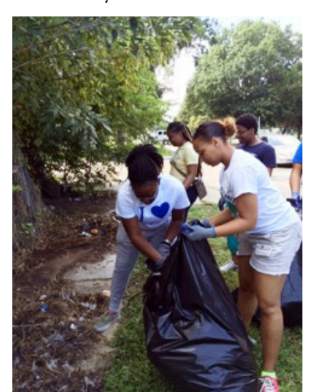
Volunteers dispose of trash and debris in the Fischer community