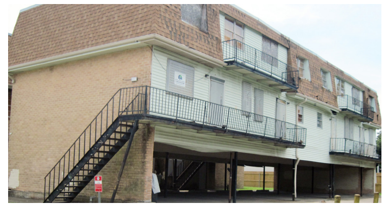
Existing Scattered Site at 5312 Constance Street