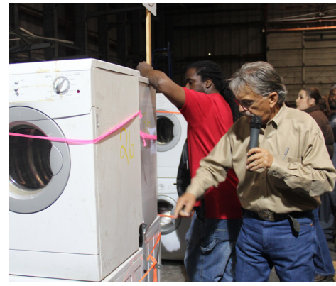
HANO auctions off a washer and dryer during the auction