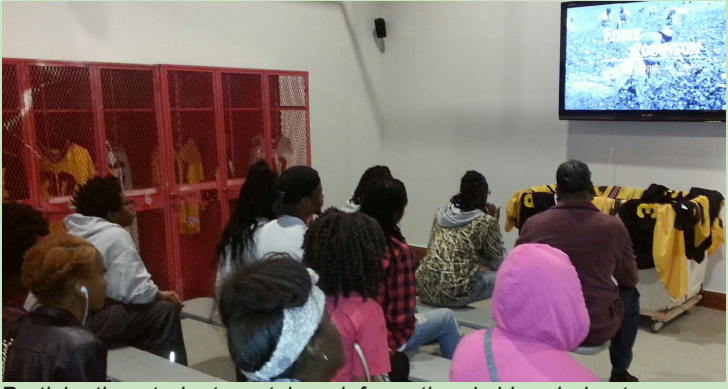
Participating students watch an informational video during tour