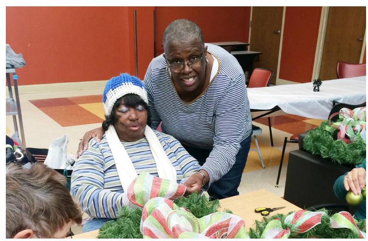
Fischer and Lafitte seniors participate in a wreath decorating class

and December, employees donated new, unwrapped toys for local children to celebrate Christmas. Employees donated board games, a drum set, wooden foosball table, activity building blocks, action figures, drawing supplies, and much more.