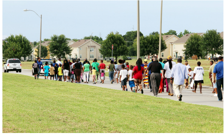
Residents join HANO PD for an anti-violence walk in The Estates community