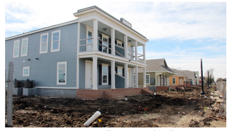
The new site of the Florida community