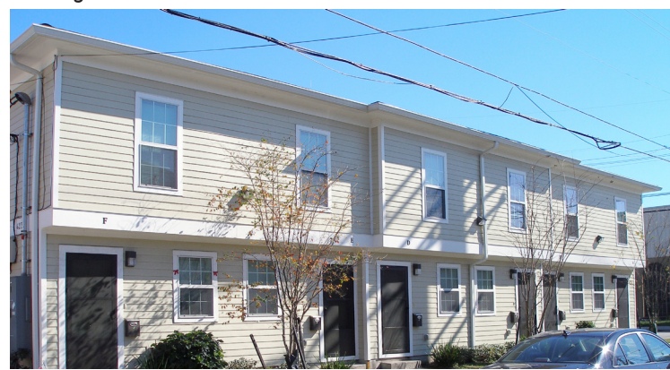
Rehabilitated Scattered Site at 4235 Tchoupitoulas Street