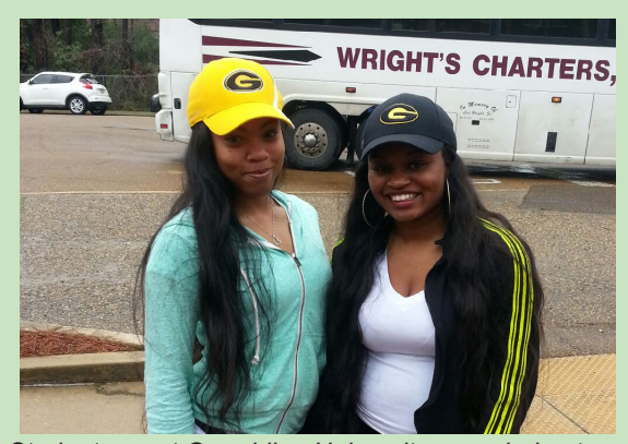
Students sport Grambling University gear during tour