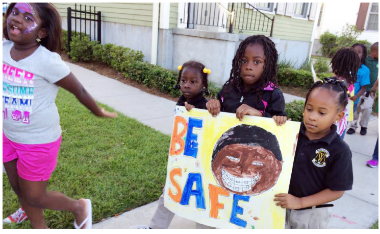
Young residents of Lafitte express their hope for a safer community