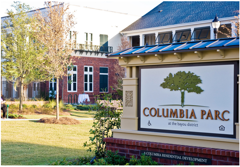
Columbia Parc at the Bayou District

Educare in the southern United States, and also is the 19th in a national network of 20 Educare facilities. St.