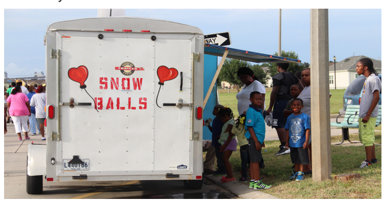
Residents and their children enjoy snowballs after the anti-violence walk at The Estates