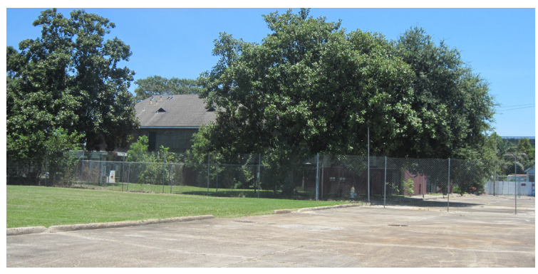
Existing Scattered Site at Mazant Royal property

HANO owns 232 vacant properties; some with buildings on them. These parcels range in size from 1,300 to 158,000 square feet and are located across the city. The agency will kick-off the demolition of the uninhabitable buildings within the next few weeks with plans to redevelop the land, prioritizing low-income individuals and families. A pool of 20 qualified developers was approved by the Board of Commissioners to implement the strategy as potential projects are defined. HANO plans to issue Requests for Proposals from the pool to begin defining potential projects.