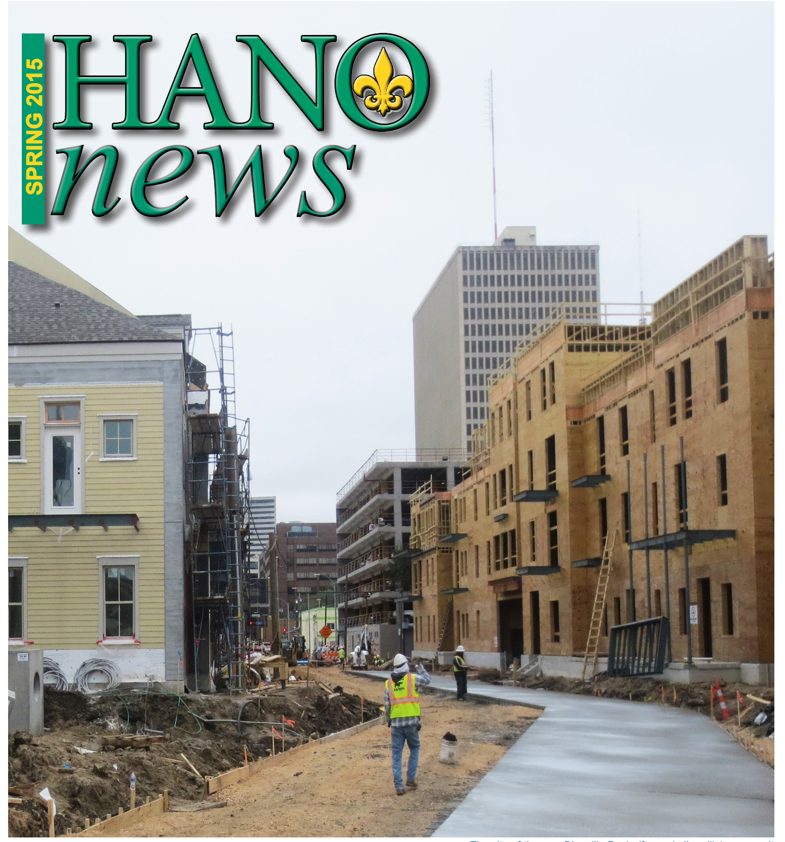
The site of the new Bienville Basin (formerly Iberville) community