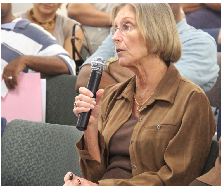
HCVP landlords ask questions during the first Stakeholders Workshop meeting

The IT Department provided a Landlord Portal training to HCVP landlords. The Development and Modernization and Procurement and Contracts Departments have scheduled a workshop with current and potential developers and professional services contractors to take place in the next few weeks. Fair Housing trainings were also hosted by HUD and the HCV Program. HANO will continue to engage its stakeholders to ensure community participation.