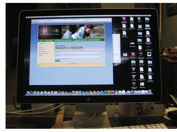
A screen shot, left, shows HANO's new website design. The new site will be more user-friendly and client interactive.

HANO's new web site, www.hano.org will make it easier for clients, community stakeholders and employees to take care of business with the authority.