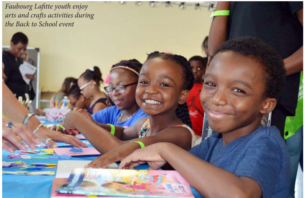
Faubourg Lafitte youth enjoy arts and crafts activities during the Back to School event

During the event, over 100 families received a backpack filled with school supplies for the 2017-18 school year. Participating organizations included Southeast Louisiana Legal Services, Aetna Healthcare, American Federation for Children, Job 1, and many more. Residents were given the opportunity to register to vote during the event.