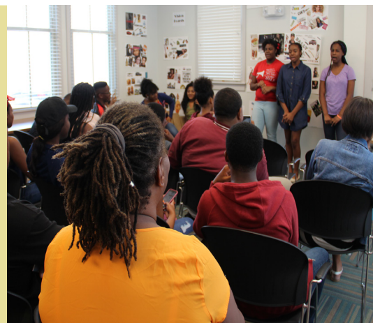
Urban Strategies' Empowerment Camp at Bienville Basin

For more information on E-camp, visit www.urbanstrategies.org .