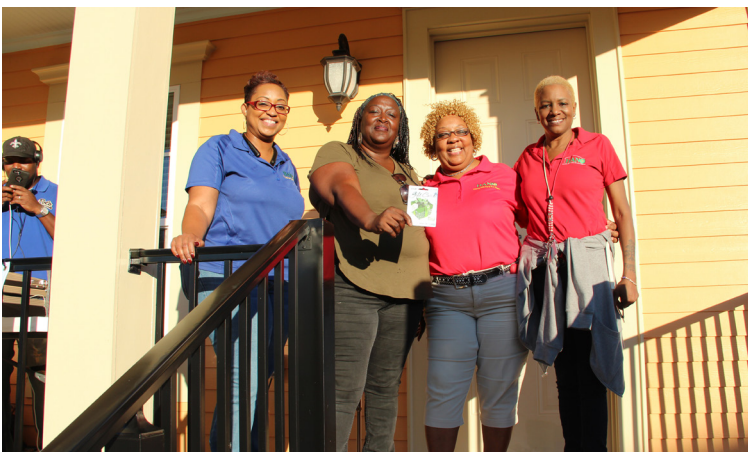
HANO staff members awarded a gift card to a New Florida resident during the raffle giveaway