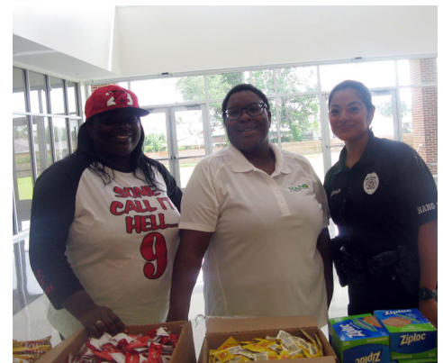
HANO employees participated in the Back to School Give-a-way

For more information on upcoming events, visit www.HANO.org .