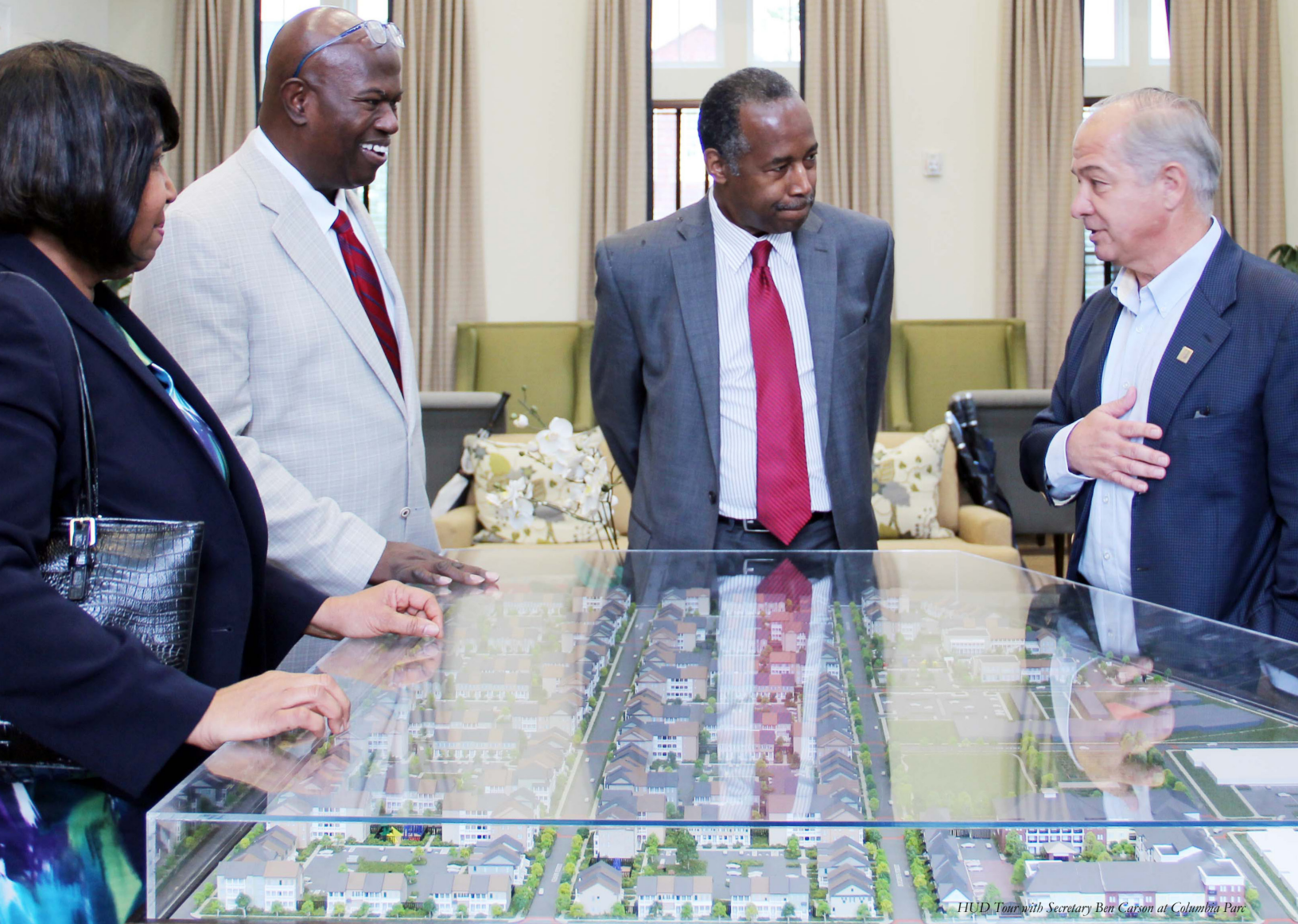
HUD Tour with Secretary Ben Carson at Columbia Parc