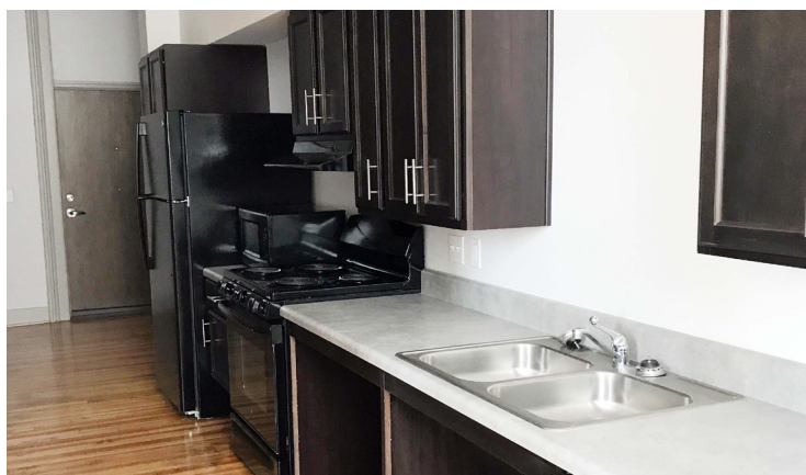
Guests toured the new senior units at the G.O. Mondy Apartments

Construction on the complex began in June 2016, and was completed a year later at an approximate development cost of $9.9 million. Thirty-two (32) of the 35 apartments will be counted toward the Choice Neighborhoods Initiative off-site replacement unit component and are subsidized by project-based vouchers.