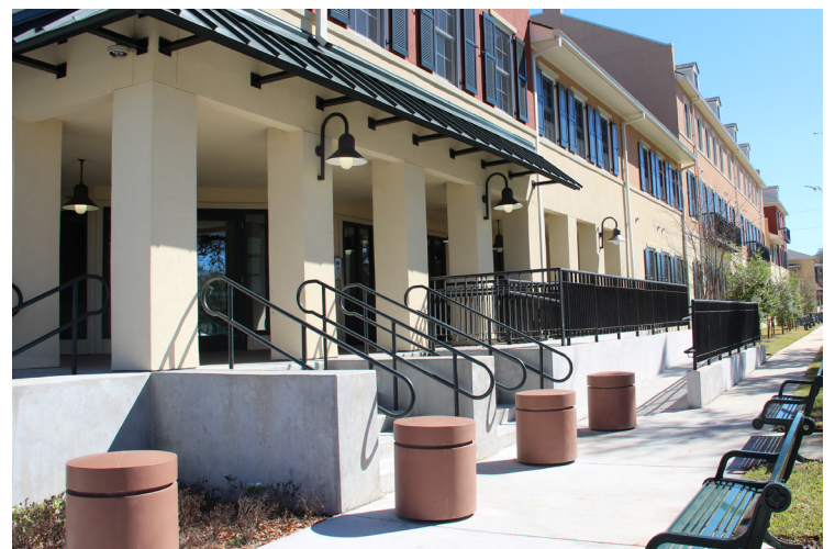
The new Faubourg Lafitte Senior Building