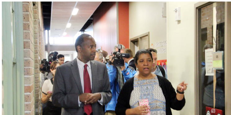
HUD Secretary Carson tours the Educare facility at Columbia Parc