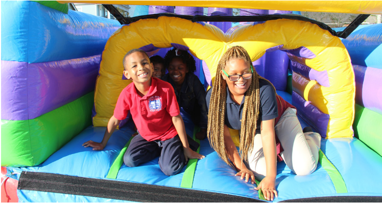
Children enjoyed a number of games and activities during the celebration