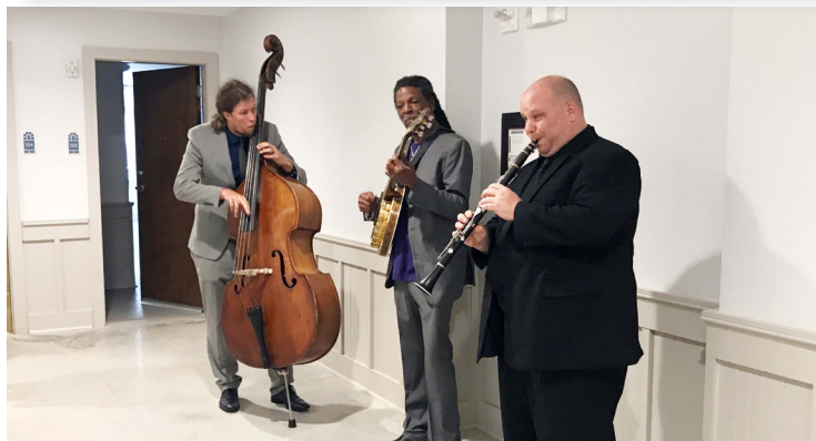
The CLeB Band entertained guests during the opening of Mondy Apartments