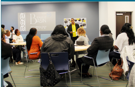
Urban Strategies' Hospitality Training Graduation

The five-week training program introduced attendees to the hospitality industry through hands-on training and coursework. Following the completion of the program, Urban Strategies' Workforce staff worked with HRI Lodging to place the trainees into local job opportunities. Currently, five program participants are employed at the Homewood Suites Hotel in the French Quarter.