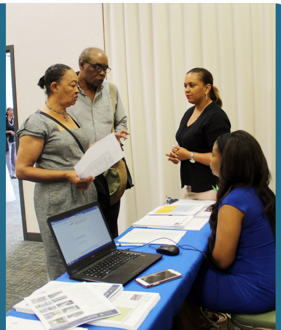
Congressman Cedric Richmond's 7th Annual Small Business Expo

To stay up to date on HANO events across the city, visit the agency's website at www.HANO.org .