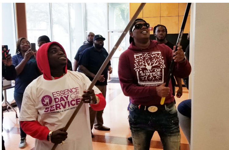
Rapper Master P and Kodak Black paint the interior of Guste Homes