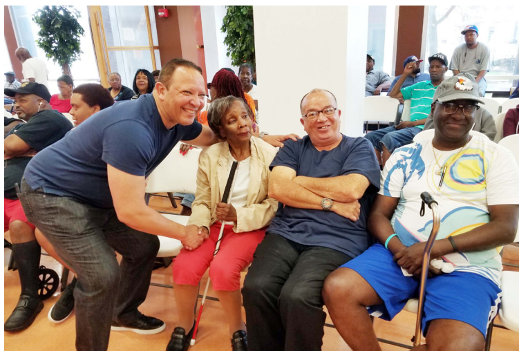
Urban League President Marc Morial pictured with Guste senior residents

Known as a “party with a purpose” for the past 20 years, the Essence Music Festival continued the tradition of giving back to New Orleans communities this year by partnering with local rapper Master P and his non-profit organization, Team Hope NOLA, for a day of service at Guste Homes. This year’s theme for the Essence Festival Day of Service was to emphasize the importance of serving local youth and seniors in urban communities, such as Guste Homes.