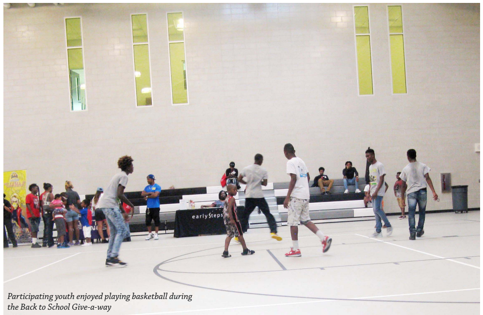
Participating youth enjoyed playing basketball during the Back to School Give-a-way