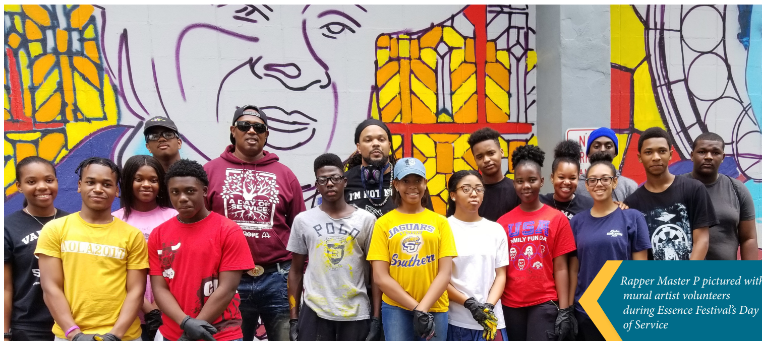
Rapper Master P pictured with mural artist volunteers during Essence Festival's Day of Service