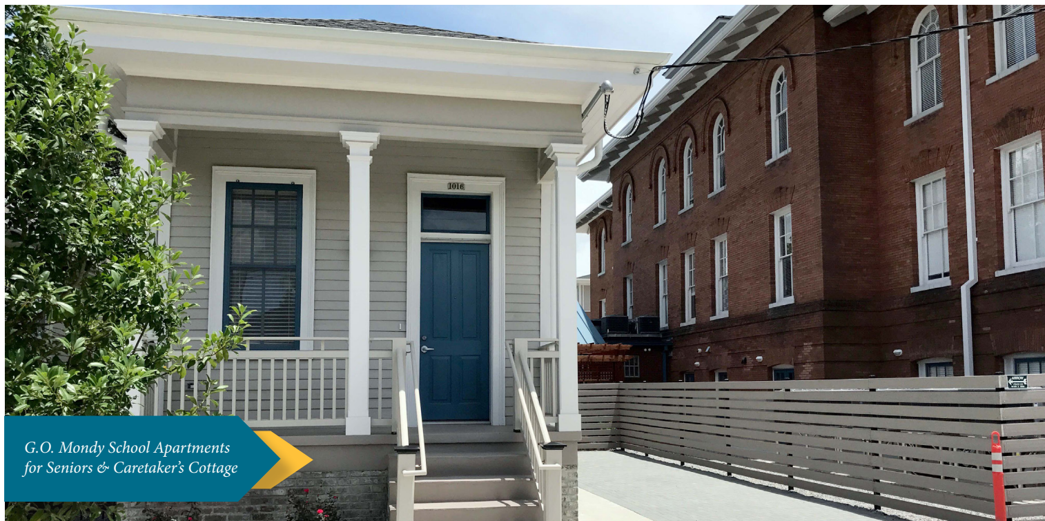
G.O. Mondy School Apartments for Seniors & Caretaker's Cottage

In the midst of an affordable housing crisis underway in the city of New Orleans, more public-private partnerships are paving the way to reduce the number of families in need of sustainable homes. Most recently, Neville Development LLC partnered with HANO and the Orleans Parish School Board to acquire the George O. Mondy Elementary School and Caretaker's Cottage to rehabilitate it into a new housing complex. The restoration of what is now referred to as the G.O. Mondy School Apartments has added 35 affordable apartments for seniors to the City's affordable housing stock.