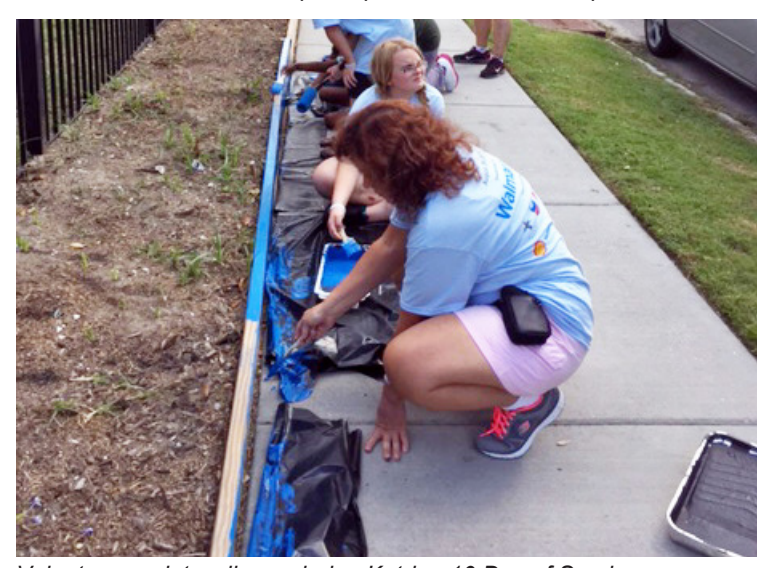
Volunteers paint walkway during Katrina 10 Day of Service