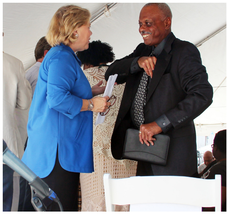
Fortner greets former Senator Mary Landrieu at the grand opening of the Bienville Basin community

New Orleans' $600 million CNI Transformation Plan covers the one-for-one replacement of all 821 dwelling units at Iberville both on-site and in the surrounding neighborhood, and the revitalization of more than 300 blocks within the boundaries of Rampart Street, Tulane Avenue, Broad Street, and St. Bernard Avenue. The Iberville Housing Development was originally constructed in 1941, and was New Orleans' last standing conventional public housing development to be revitalized since Hurricane Katrina.