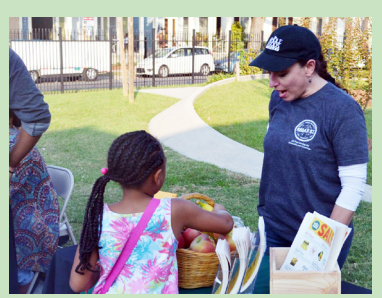
Night Out Against Crime at Faubourg Lafitte Community