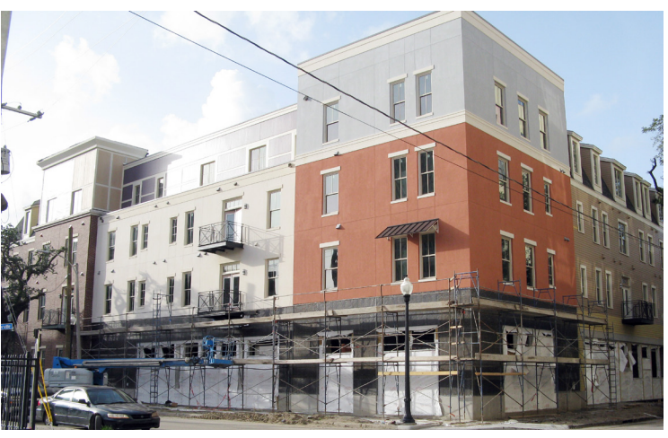
Construction at the Bienville Basin community

Extensive outreach was performed to ensure that the 413 former Iberville families were given the preference to