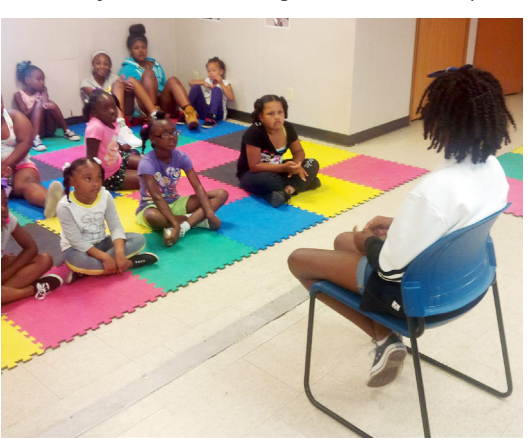
Summer camp participants at The Estates enjoyed music, arts and crafts, and much more