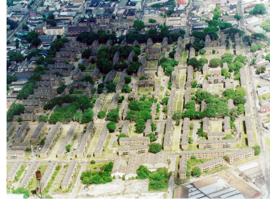
The site of the former St. Thomas public housing development

integrated with their surrounding neighborhoods at a total investment of more than $300 million. The demolition of the Florida, C.J. Peete (Harmony Oaks)