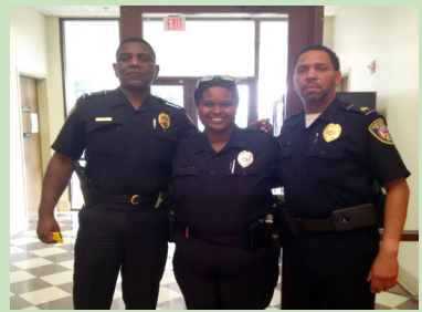
HANO PD joined residents at Fischer's Night Out Against Crime

In October, HANO communities and neighbors joined forces with the New Orleans Police Department (NOPD) and HANO PD for the 32nd Annual Night Out Against Crime across the city. The purpose of Night Out Against Crime is to forge police-community partnerships and decrease criminal activity throughout the city.