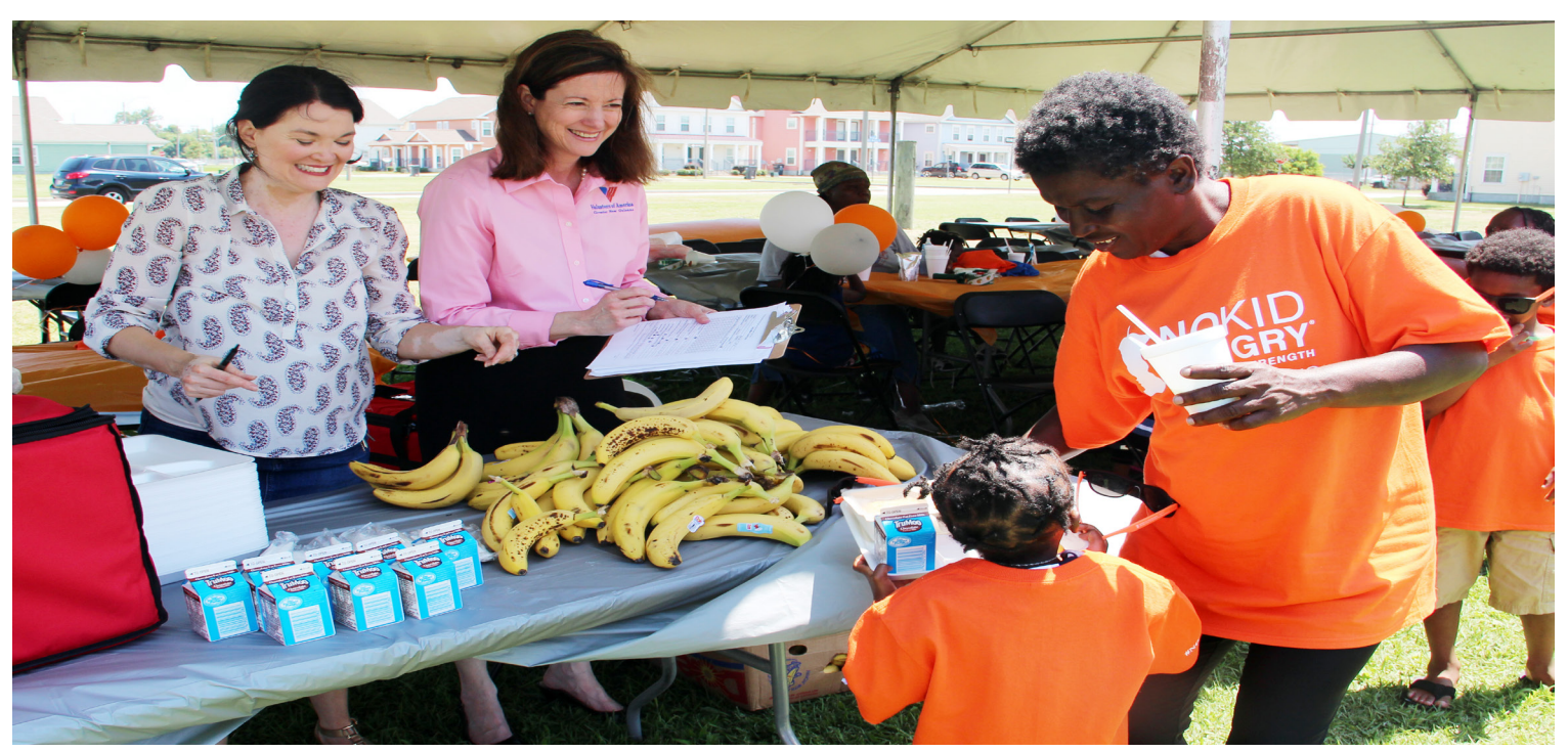
Representatives from Volunteers of America distribute free, healthy lunch to children ages 18 and under

The Housing Authority joins New Orleans' No Kid Hungry to kick-off summer meal program at The Estates