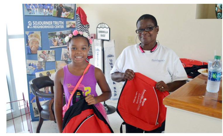
A student receives a backpack during Lafitte's Back to School Bash