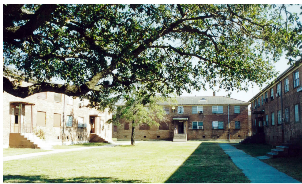
The site of the former Desire public housing development

ore than a decade ago in the mid-to-late 1990's, the Housing Authority of New Orleans kicked off one of the most comprehensive redevelopment programs in the country. During this moment in history, most public housing complexes were deemed uninhabitable, and resident relocation had begun to repair and revitalize the buildings. The agency was also stripped from local management, and the U.S. Department of Housing and Urban Development (HUD) appointed the first of several federal administrative receivers. HUD deemed HANO a troubled agency and seized management over all financial and operational functions.