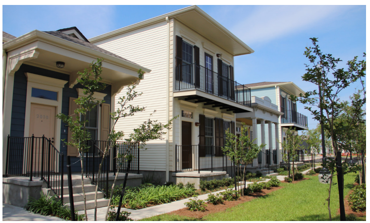
Faubourg Lafitte community