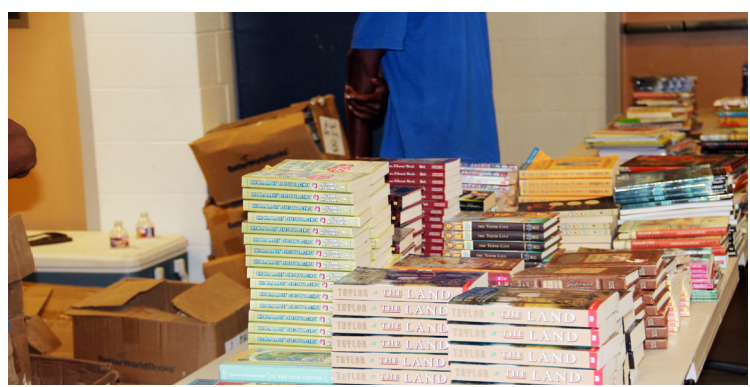
HANO, Hammonds Transportation and its partners distribute books and supplies to students for the 2015-16 school year