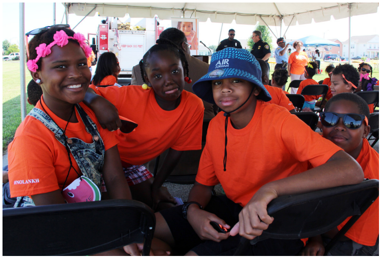
Summer campers from The Estates participated in the Share Our Strength's No Kid Hungry event

Share Our Strength's No Kid Hungry campaign strives to end child hunger by connecting children in need with healthy food on a daily basis, and also teaching their families how to cook nutritious, affordable meals. To learn more about the No Kid Hungry program and its designated sites, visit <a href="https://www.NewOrleans.NoKidHungry.org">www.NewOrleans.NoKidHungry.org</a>.