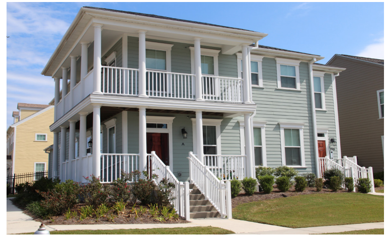
Harmony Oaks community

in secluded conventional brick buildings.