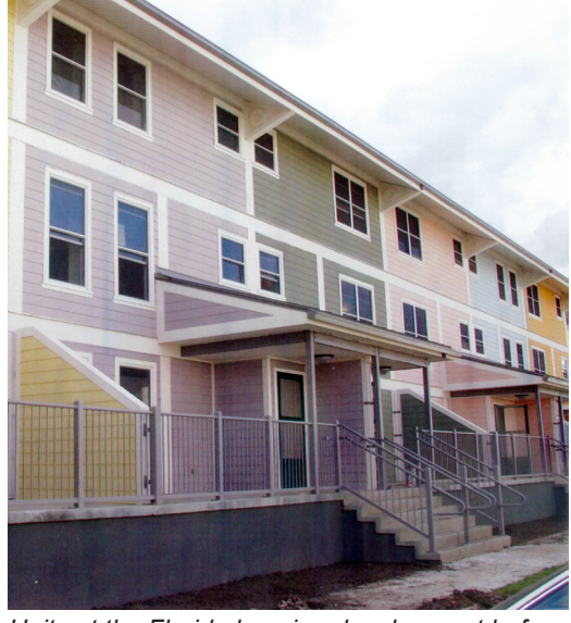
Units at the Florida housing development before Hurricane Katrina devastated the community

residents had evacuated to other cities across the country and were not allowed back into the city for some time. Eventually, HANO used Iberville as a location for returning residents, but in 2007, the New Orleans City Council