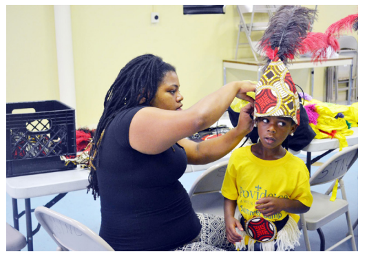
Youth at the Faubourg Lafitte summer camp practice their music and dance moves