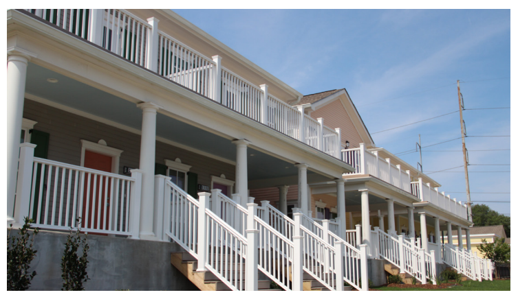
Marrero Commons community