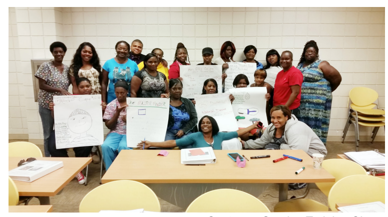
Customer Service Training Class

Urban Strategies' Customer Service Training Program introduces students to the fundamental concepts of customer service. Through the five-week, 45-hour training, students learn the definition of customer service and its importance, and also what constitutes excellence in customer service. The course trains students on the practical skills required by customer service professionals, provides virtually-stimulated scenarios in which to test their knowledge, and includes guest speakers from local businesses.