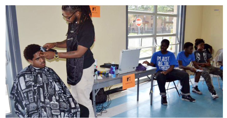
Students in the Lafitte community also take advantage of a free haircut in preparation for the first day of school