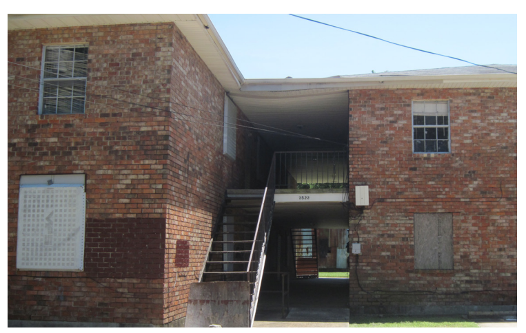
Scattered Site Property at 2522 North Rampart Street

HANO owns 232 vacant properties; some with buildings on them. These parcels range in size from 1,300 to 158,000 square feet, and are located across the city. A pool of 20 qualified developers was approved by the Board of Commissioners to implement the strategy as potential projects are defined. To view the Scattered Sites Strategy, visit www.HANO.org.